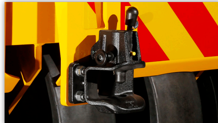
Vehicle Tow Hitch