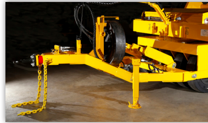
Goose Neck Drawbar