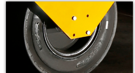
Solid Filled Tyres