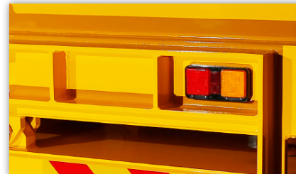
Heavy Duty Push Bar