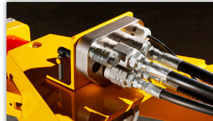
Mono-block Hose Coupling