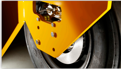
Electric/hydraulic Disc Brakes