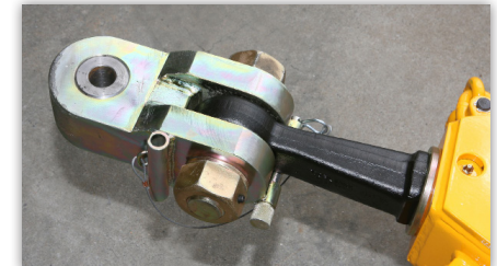
Swivel Hitch Adaptor