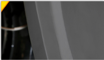
36mm Roll Drum Skin